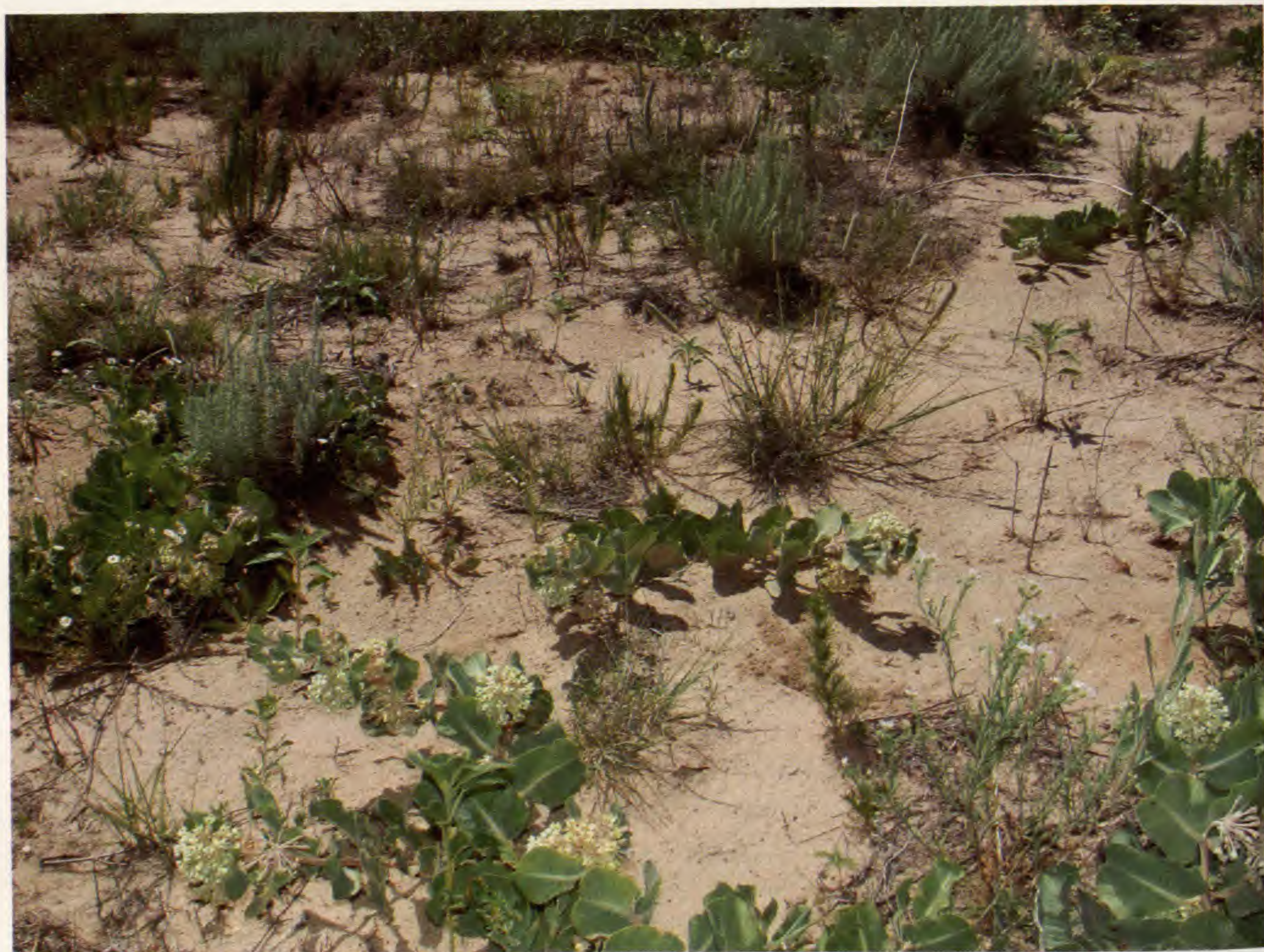
FIG. 4. Dalea cylindriceps in Artemisia filifolia community, Cheyenne County, Colorado.

Dalea cylindriceps has been collected (to a lesser extent) in other sandy-gravelly habitat, notably the alluvial deposits of streams and colluvium derived from sandstone outcrops and escarpments. The mostly herbaceous plant communities that develop in such habitat occur as small patches or bands of vegetation in the landscape